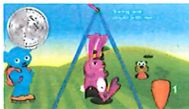
Park Math - Duck Duck Moose